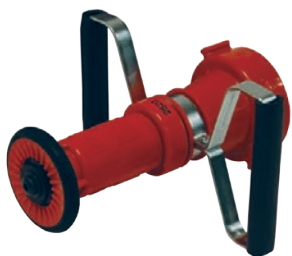
2½" nozzle with handles CFB250NST