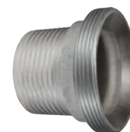
6" and 8"