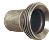
3" and 4"