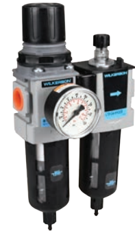
with transparent bowl and guard