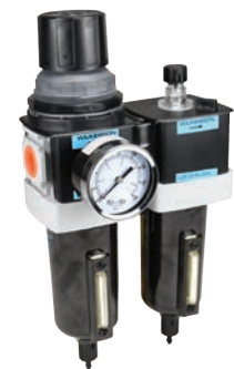
with metal bowl